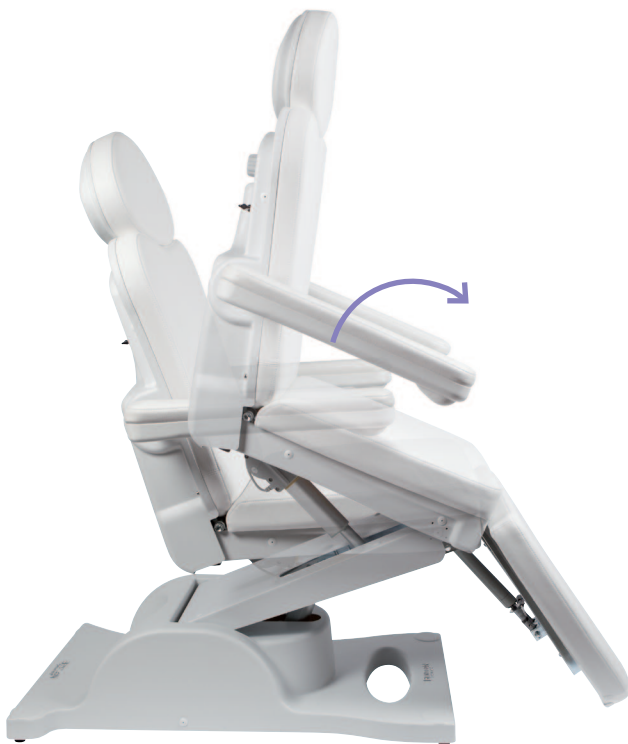
Unique, patented step-in and out seat assist