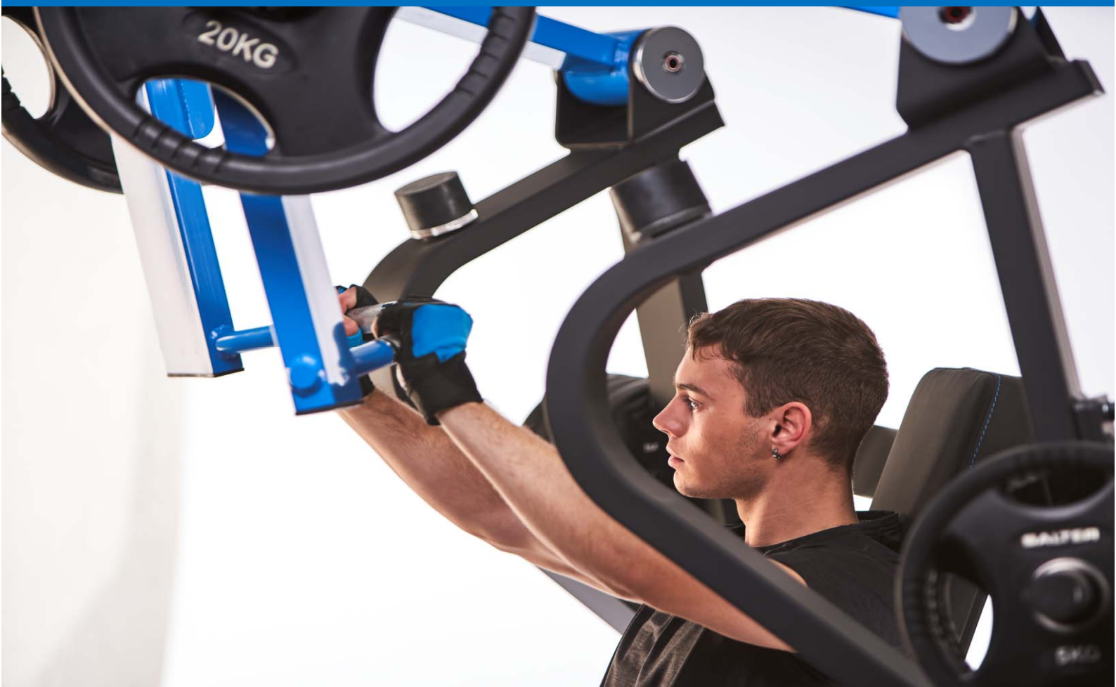
PLATE LOADED MACHINES